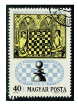
A chess game from a 12th century manuscript illustration

Another interesting possible philatelic pursuit would be stamps about the game of chess. Chess is a board game for two players. The board consists of an 8 x 8 matrix of squares alternating between light and dark. Each player starts with a set of 16 game pieces; one white, one black, placed on the board on the two rows of squares nearest them. There are two rooks, two knights, two bishops, a queen and a king on the back row and in front of them, eight pawns. Pieces may only move in ways specific to that piece. For example, a bishop may only move diagonally, the rook either horizontally or vertically across the board, but not diagonally. The ultimate object of the game is to move your pieces across the board capturing the opponent's pieces. The first player to capture, or checkmate, his opponent's king, wins. Checkmate occurs when any possible move by